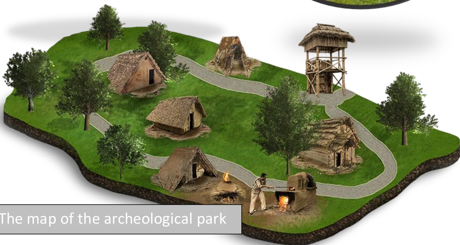
The map of the archeological park